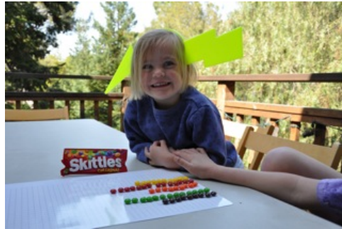
CANDY BAR GRAPHS